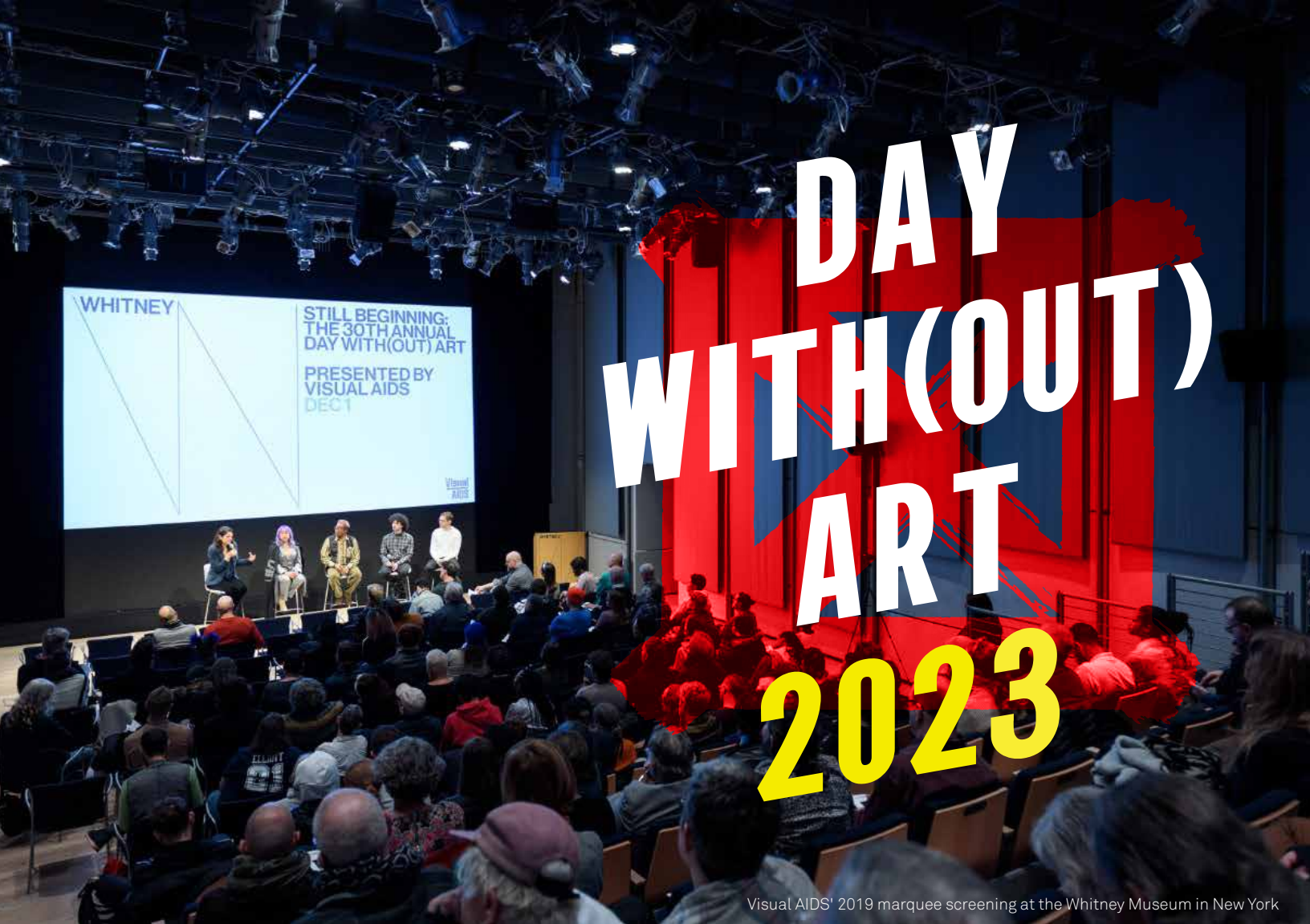
Visual AIDS' 2019 marquee screening at the Whitney Museum in New York