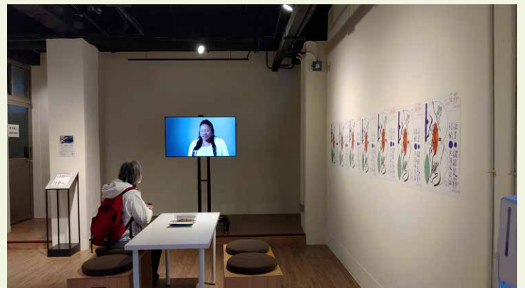
A looping presentation at Taiwan Contemporary Culture Lab in Taipei

For a complete archive of past commissions, visit video.visualaids.org