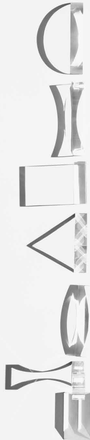
SARAH CHARLESWORTH Crystals , 2011 Fuji Crystal Archive Print, mounted and laminated with lacquer frame 41 x 32 inches