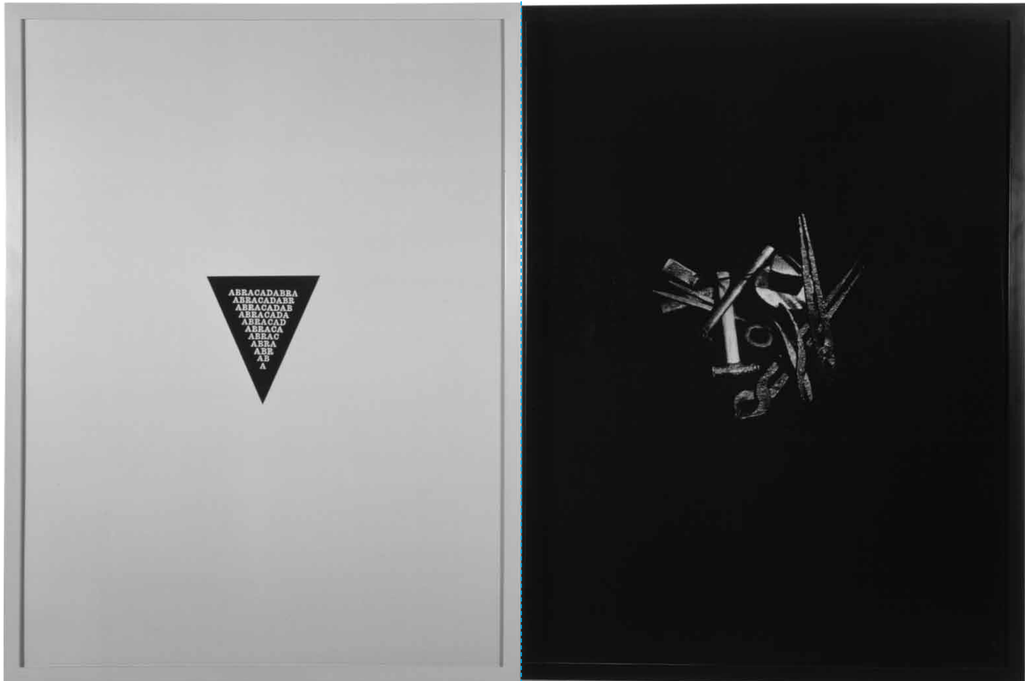
SARAH CHARLESWORTH Work , 1988 Cibachrome with lacquered wood frames Diptych 42 x 62 inches